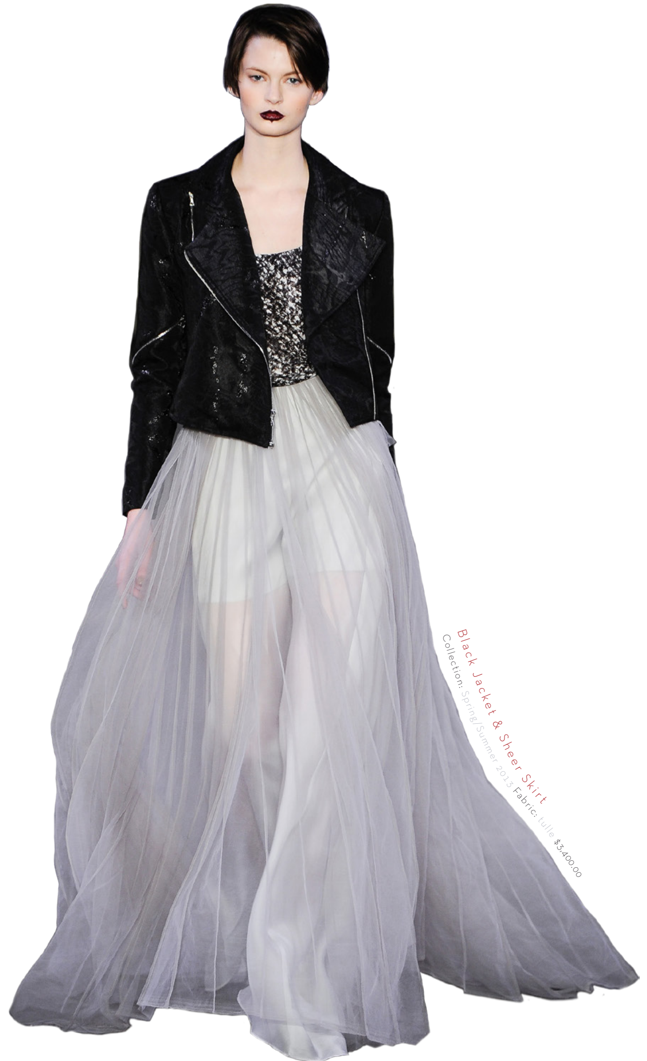
Black Jacket & Sheer Skirt Collection: Spring/Summer 2013 Fabric: tulle $3,400.00

Accessories included fur stoles, chain handle shoulder bags, and fuchsia croco, gold glitter, black pony hair, and gold lorix. Footware consisted of an assortment of metallic heeled Christian Siriano for Payless Pumps and ankle boots with shiny hardware, and wedges with sculptural platform soles