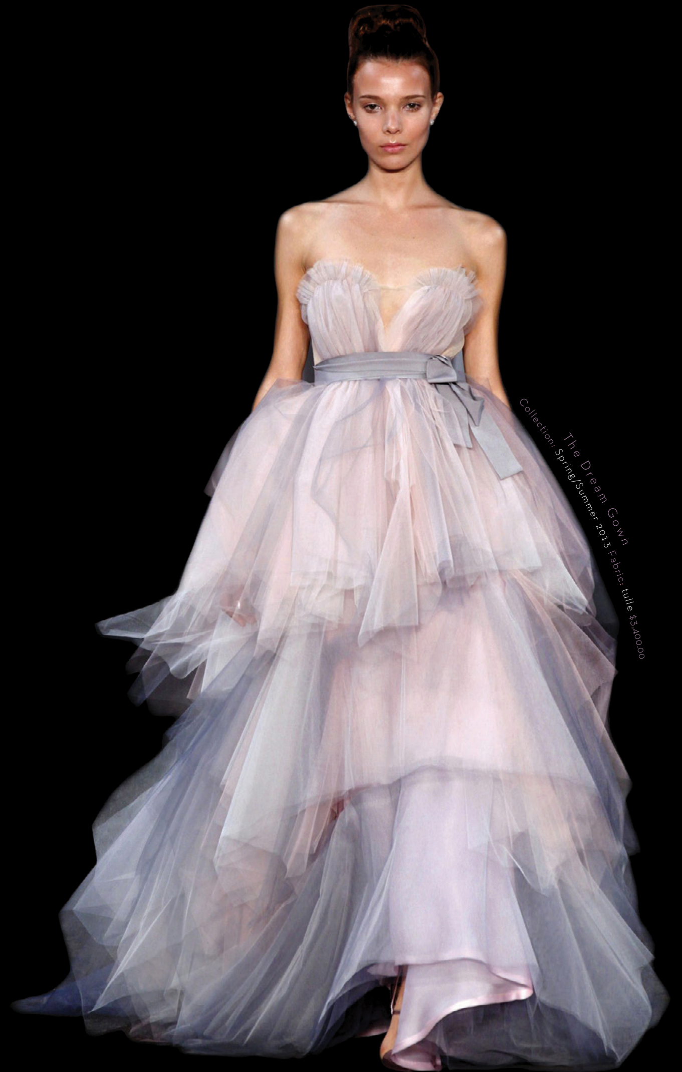
The Dream Gown Collection: Spring/Summer 2013 Fabric: tulle $3,700,000

white, that were wearable for day and night.