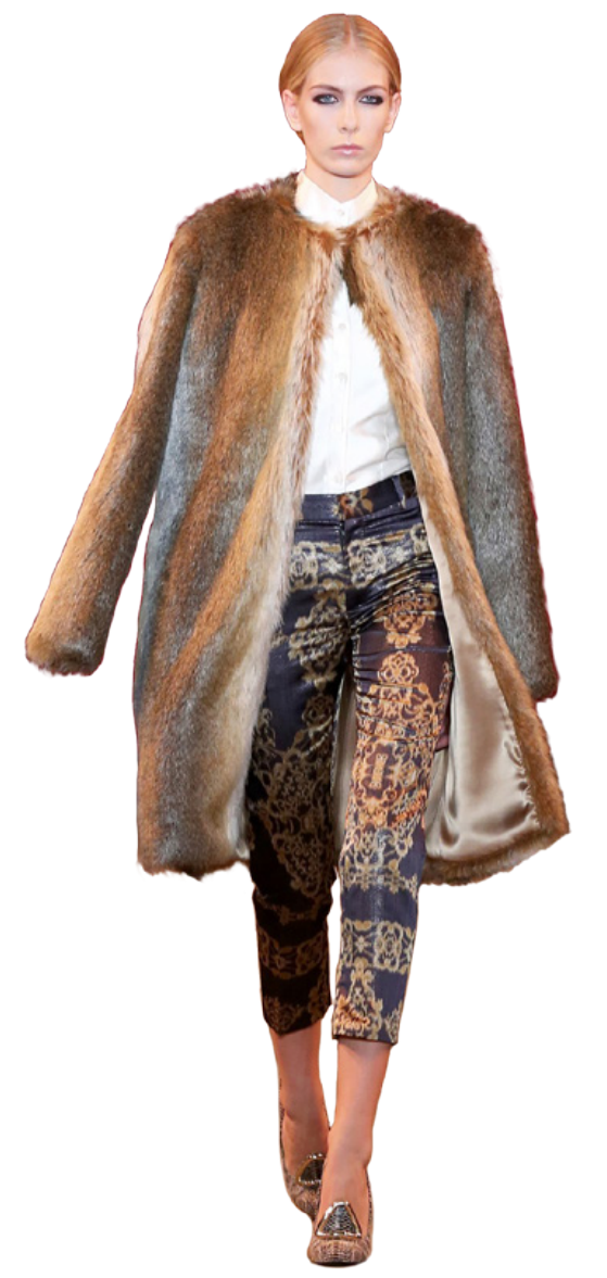
Fur Coat Fabric: faux fur $1,400