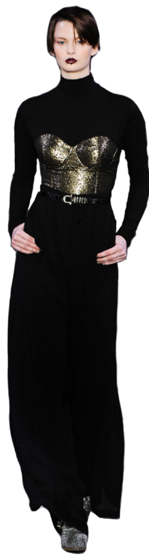
Gold Corset Dress Fabric: black, gold sequin $450