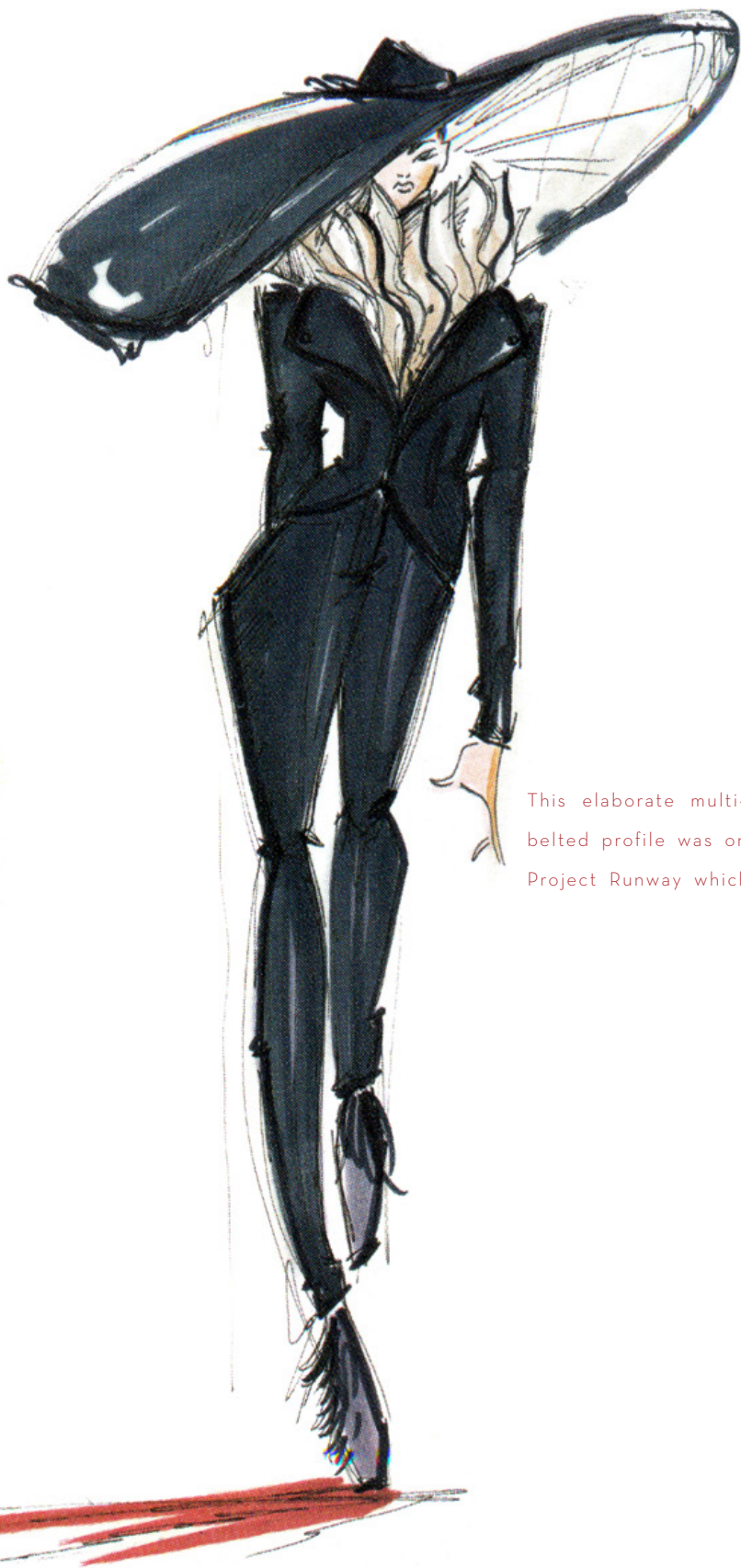
This elaborate multi-toned ruffle dress with Christian's trademark belted profile was one of twelve pieces of his final collection from Project Runway which was shown at New York Fashion Week 2008.