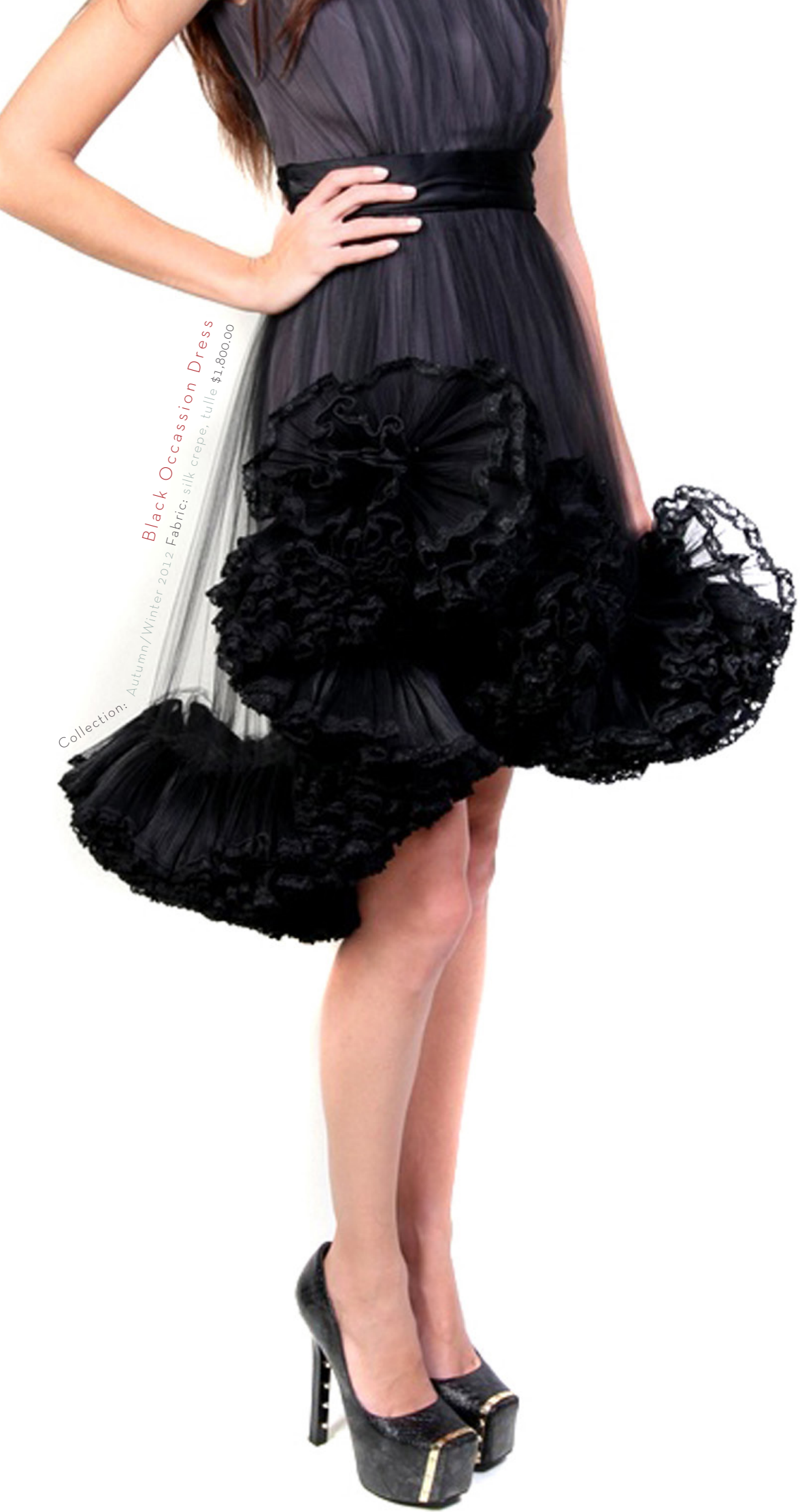
Collection: Autumn/Winter 2012 Black Occasion Dress Fabric: silk crepe, tulle $1,800.00

O f course no Siriano show would be complete without ball gowns boasting trumpet skirts, beaded scalloped details, and tulle crepe. He offered several breathtaking options, but clung to his theme by affixing winged sleeves and tulle shoulders to his black, beaded creations.