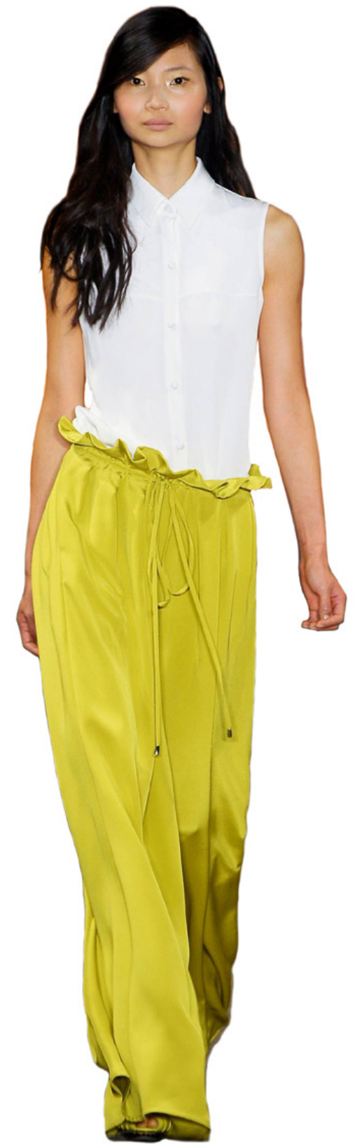
Chartreuse Drawstring Pant