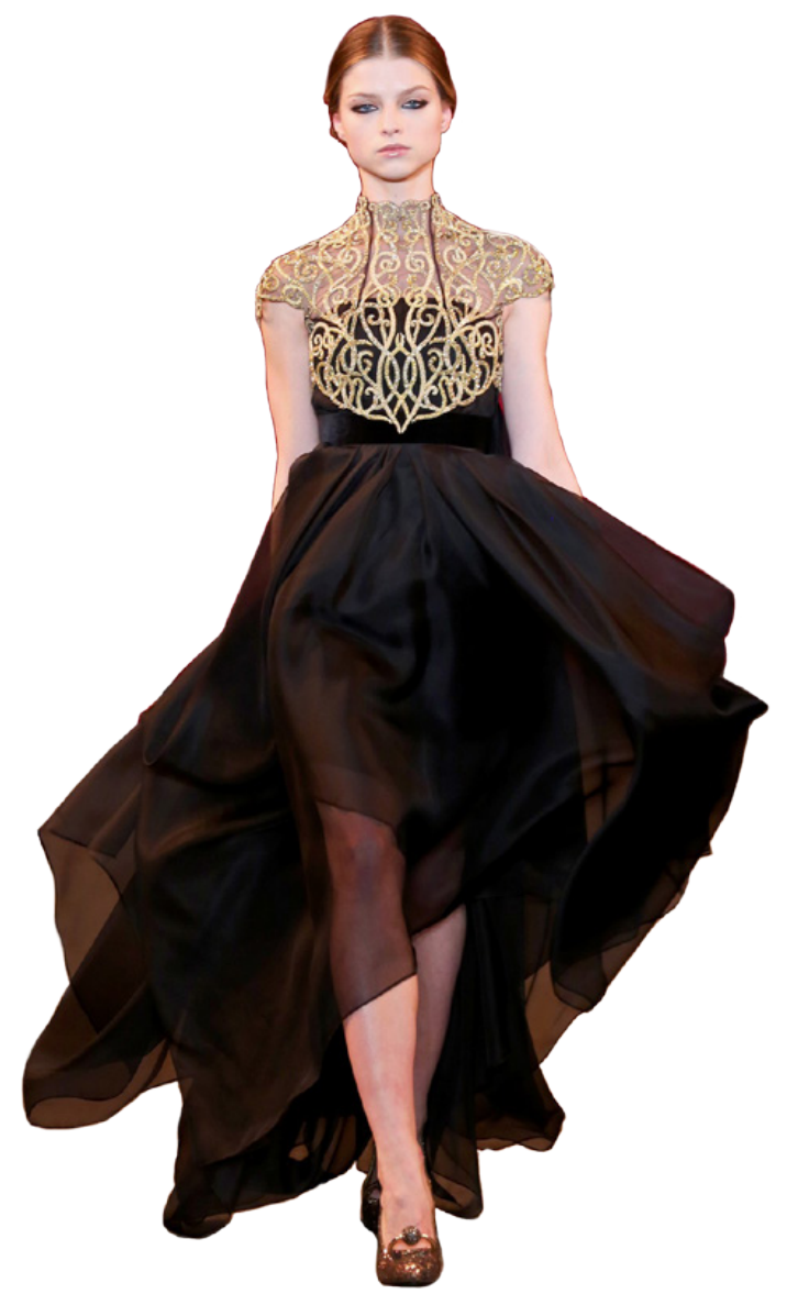
Gold Lace Gown Fabric: silk organza, gold trim lace $1,800