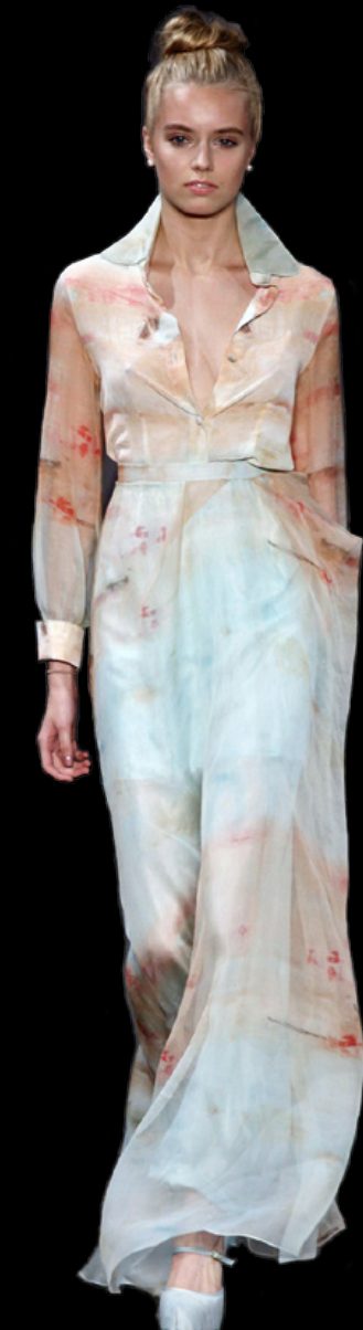
Ballet Print Waist Dress Fabric: silk $1,000