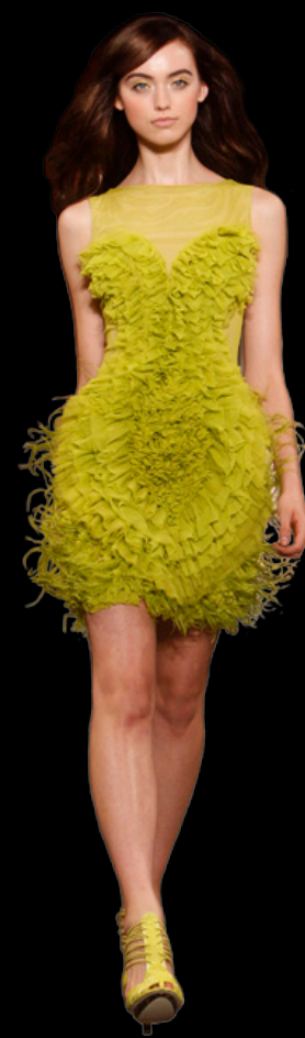
Chartreuse Cocktail Dress Fabric: silk crepe $1,400