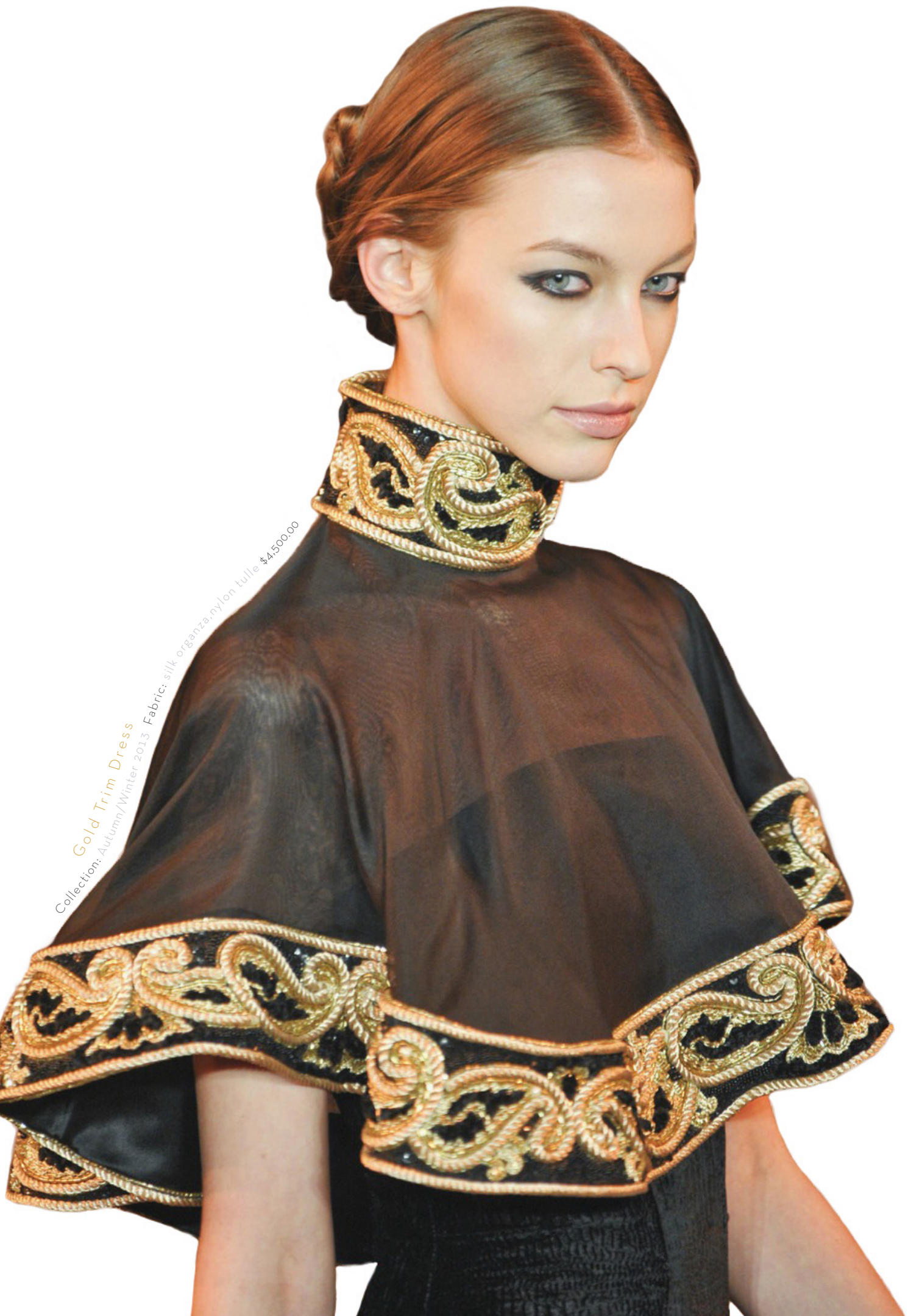
Gold Trim Dress Collection: Autumn/Winter 2013 Fabric: silk, organza, nylon tulle $4,500.00