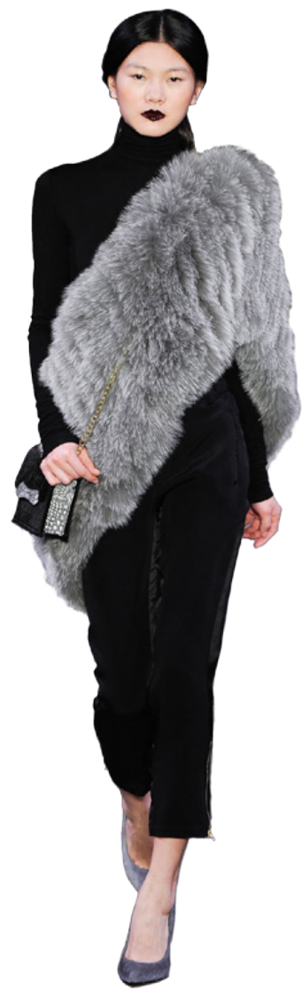
Grey Fur Shaw Fabric: fur $250