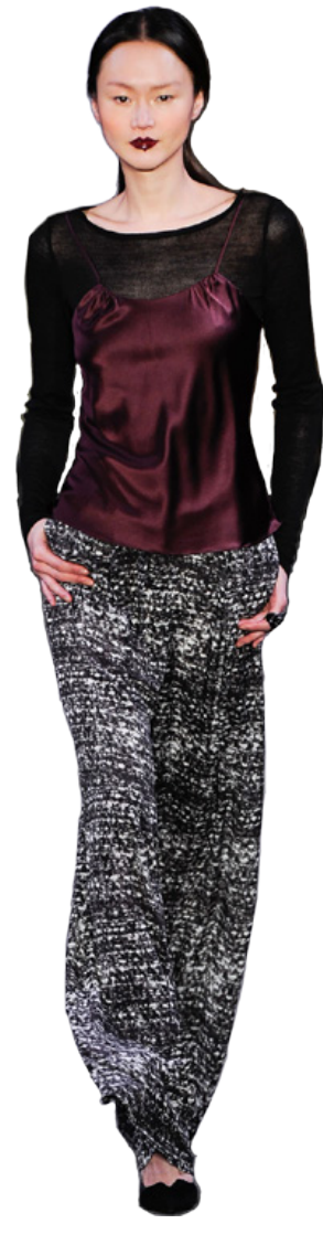
Lady Vamp Casual Fabric: silk, cotton $198