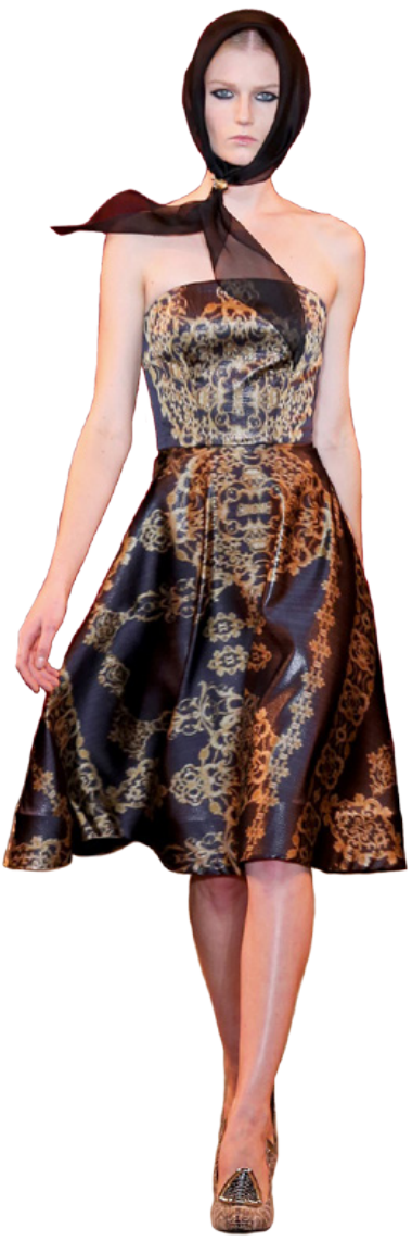
Gold Floral Dress Fabric: printed silk crepe $198