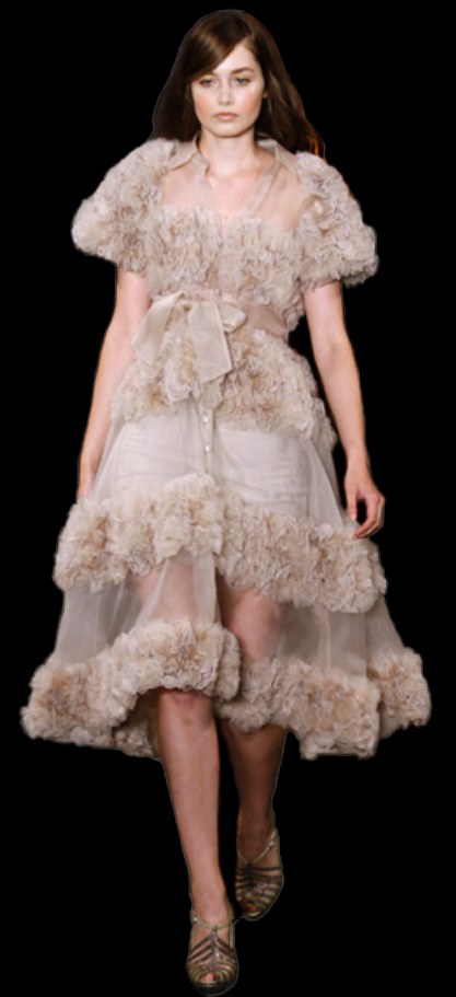
Cream Fur Dress Fabric: tulle, faux fur $1,800