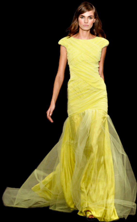
Chartreuse Gown Fabric: tulle, silk crepe $2,000