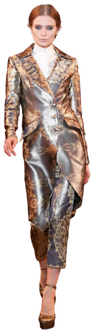
Patterned Suit Fabric: textured leather $1,000