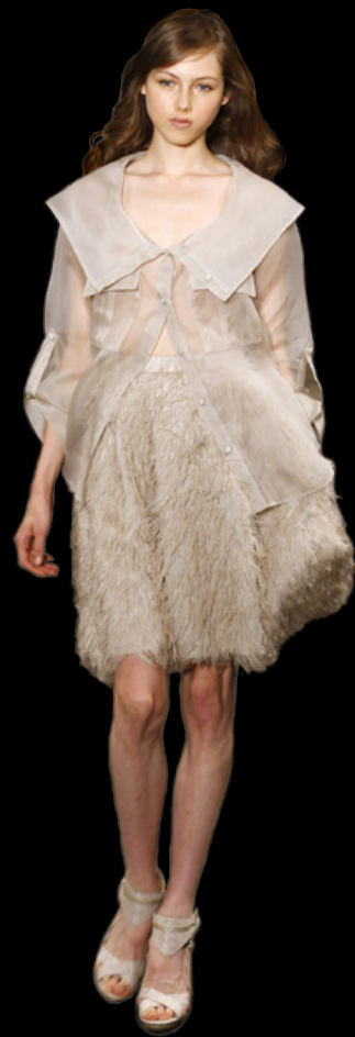
Tulle Blouse & Fur Skirt Fabric: tulle, faux fur $1,000