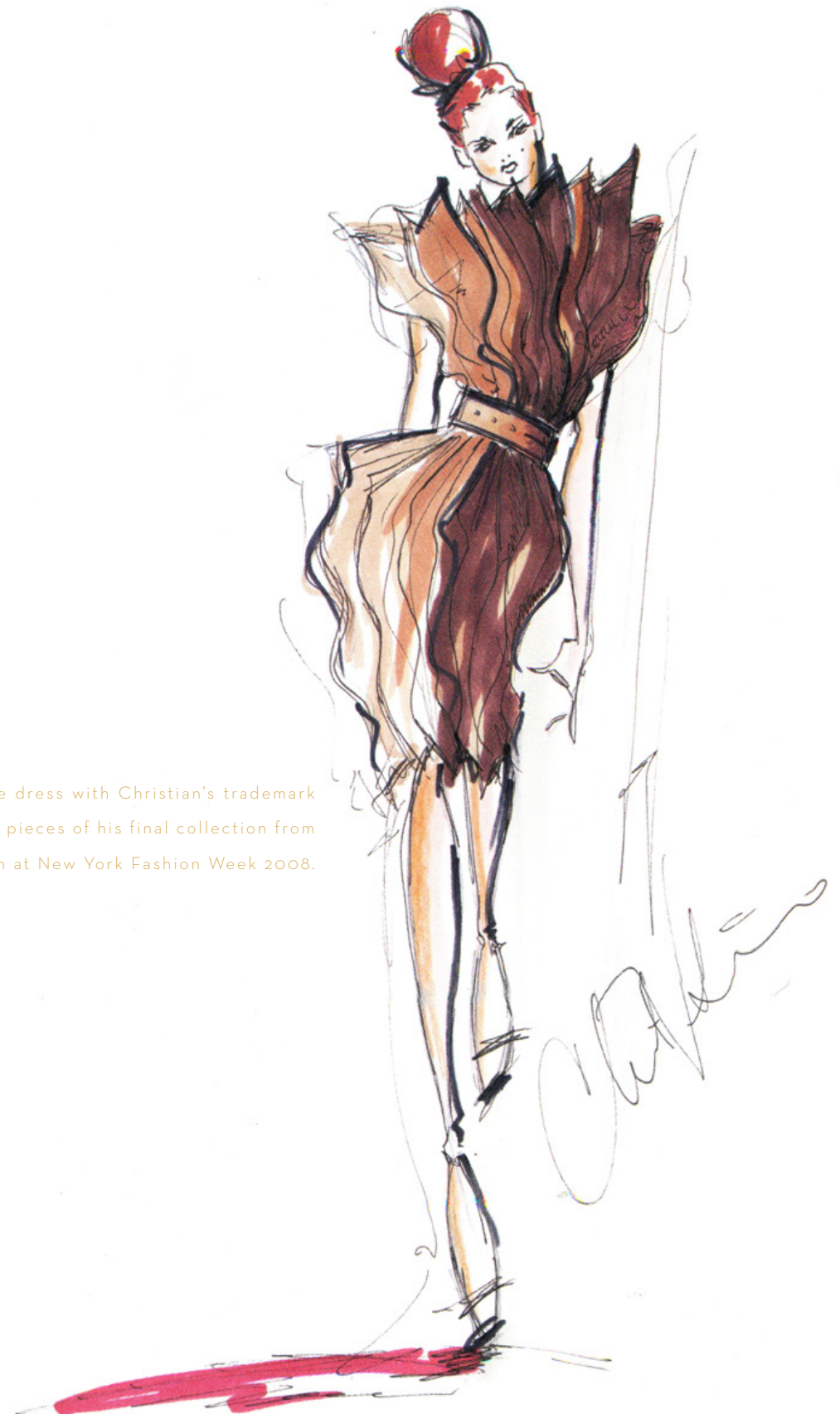
This elaborate multi-toned ruffle dress with Christian's trademark belted profile was one of twelve pieces of his final collection from Project Runway which was shown at New York Fashion Week 2008.