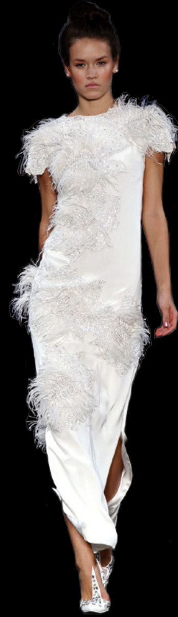
Feather Maxi Dress Fabric: leather piping on mesh $1,000