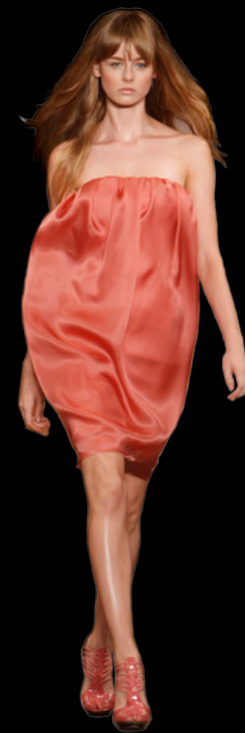
Salmon Tube Dress Fabric: silk cotton $1,250