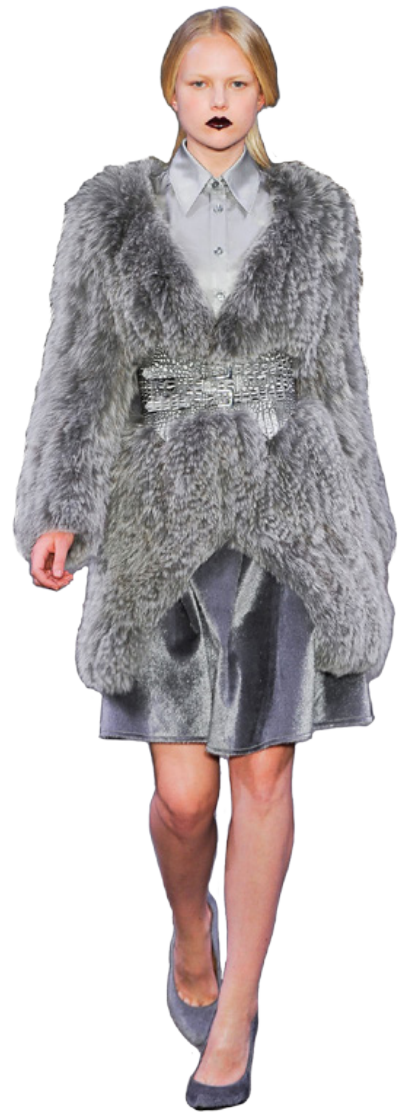
Grey Fur Coat Fabric: fur $980